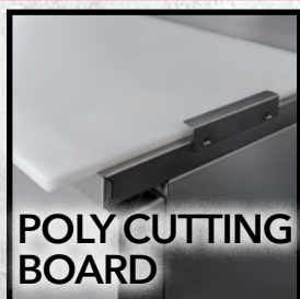
POLY CUTTING BOARD