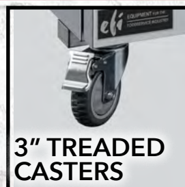
3" TREADED CASTERS