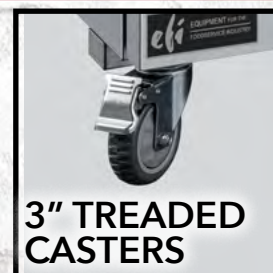
3" TREADED CASTERS