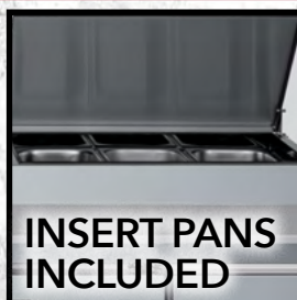
INSERT PANS INCLUDED