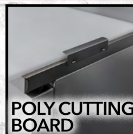
POLY CUTTING BOARD