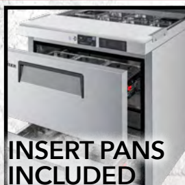
INSERT PANS INCLUDED