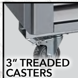
3" TREADED CASTERS