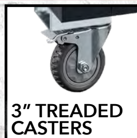
3" TREADED CASTERS