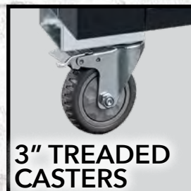
3" TREADED CASTERS