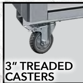
3" TREADED CASTERS