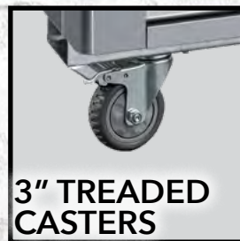
3" TREADED CASTERS