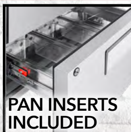
PAN INSERTS INCLUDED