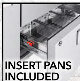
INSERT PANS INCLUDED