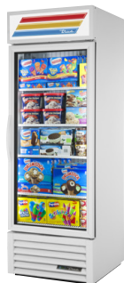
Optional White Exterior