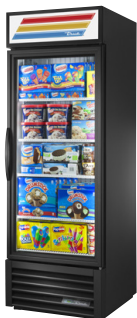
Standard Black Exterior