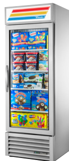
Optional Stainless Exterior (FGD01 Doors)