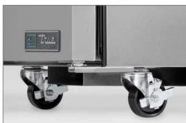
ADA 3" Castors