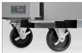
Standard 5" Castors