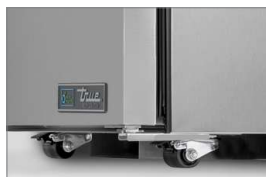
Low Profile (LP) 1½" Castors Upcharge applies for (LP) size castors