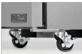
ADA 3" Castors