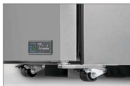
Low Profile (LP) 1½" Castors Upcharge applies for (LP) size castors