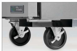
Standard 5" Castors