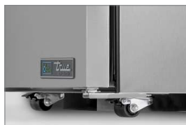
Low Profile (LP) 1½" Castors Upcharge applies for (LP) size castors