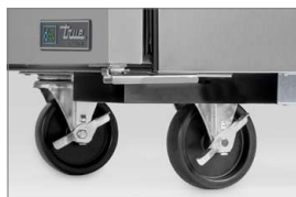
Standard 5" Castors