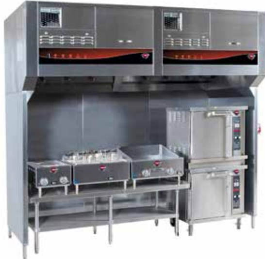
Model WVU-96 (equipment sold separately)