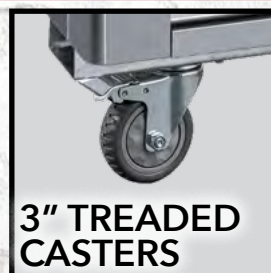
3" TREADED CASTERS