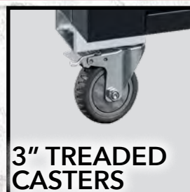
3" TREADED CASTERS