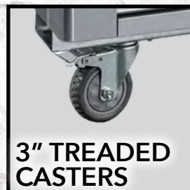
3" TREADED CASTERS