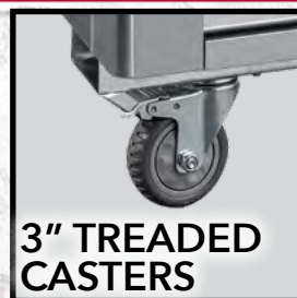
3" TREADED CASTERS