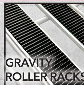
GRAVITY ROLLER RACKS