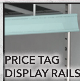
PRICE TAG DISPLAY RAILS