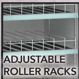
ADJUSTABLE ROLLER RACKS