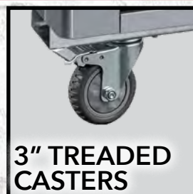
3" TREADED CASTERS