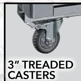
3" TREADED CASTERS