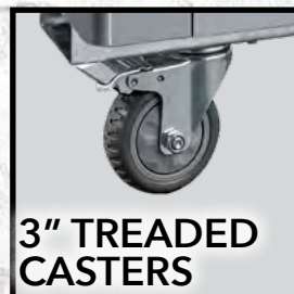
3" TREADED CASTERS