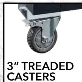
3" TREADED CASTERS